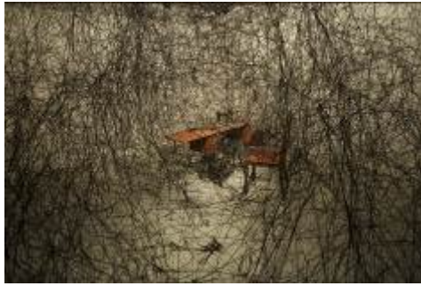
Unconscious Anxiety, 2009 // Shiseido Gallery, Tokyo

Chiharu Shiota is a Japanese artist who was born in 1972 and has been based in Berlin since 1996. She is known for creating poetic, monumental and delicate environments. Her work is characterised by a mixture of artistic performances and spectacular installations for which she uses old objects (beds, pianos, etc.) around which she weaves a complex and impenetrable network, usually made of black cord but sometimes red too. She also explores the relationships between the past and the present. The simplicity of the materials makes her work all the more striking.