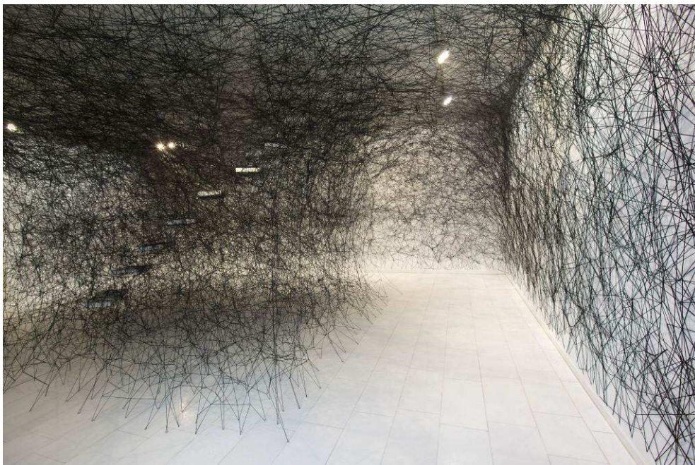
Schlesweg-Holsteinischen Kunstvereins in der Kunsthalle zu Kiel // Stear way

La Sucrière - Lyon 4 May to 31 July 2012