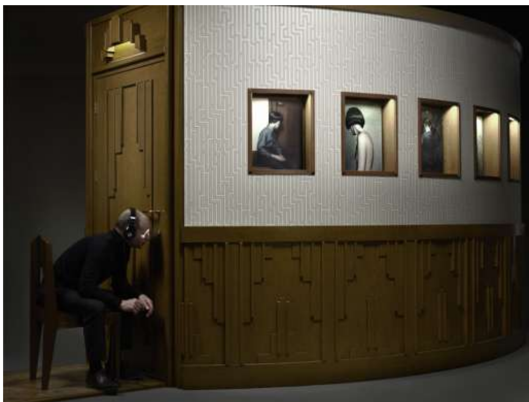
Installation view « The Keyhole », 2011, © Erwin Olaf