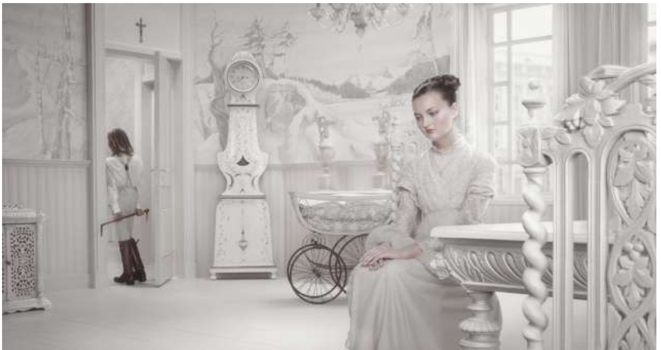
« Dawn », photography, 2009 © Erwin Olaf