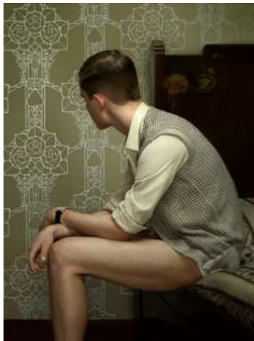
« The Keyhole », photography, 2011

Le Dernier Cri , Galerie Rabouan Moussion, Paris, France