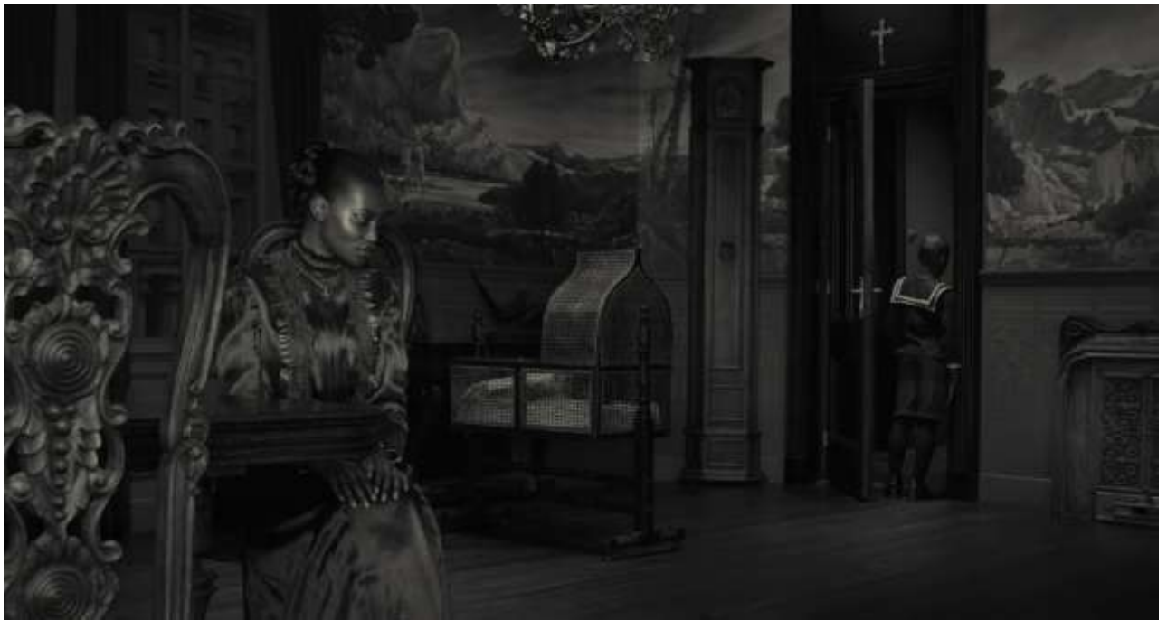
« Dusk », photography, 2009 © Erwin Olaf